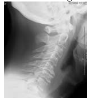
Loss of Curve & DDD

The most common sign or symptom that something has gone wrong is pain. When pain appears degenerative changes have already taken place in the spine. Most people will ignore the warning signs and will self-medicate. When the pain gets worse and no longer goes away a visit to the medical doctor is next. The medical doctor usually prescribes stronger medication. The sad fact is that this practice of medicating will not fix the cause of the problem and covers up the problem allowing the user to temporarily feel better while the condition gets worse. Medical doctors and orthopedists are poorly trained in the care and prevention of spinal degeneration. The medical doctor is great for medicating and the orthopedist is great for trying to patch up the damage. Only a chiropractor can correct the cause of the problem and prevent the condition from getting worse.